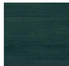
MGR Veined Grey

Designed with fine dining in mind. Improving the quality and efficiency of service. Trolley ensures that everything is on hand for a truly memorable service.